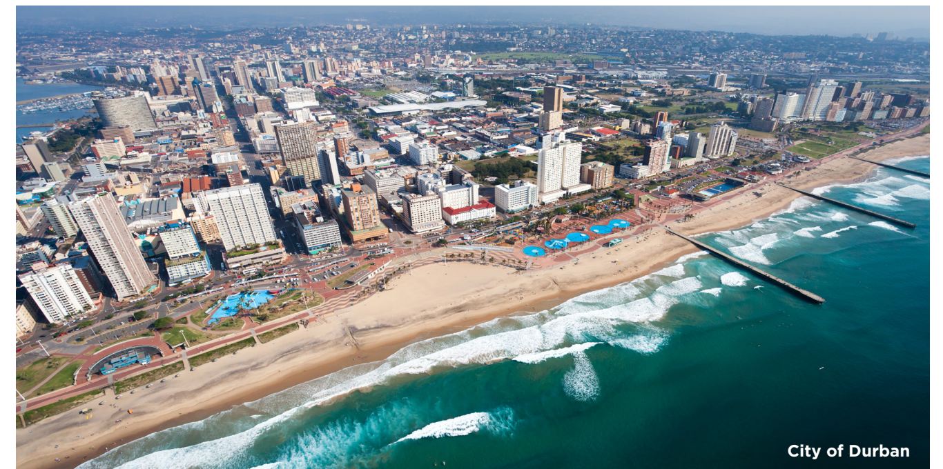
City of Durban

Cities have different powers and challenges, and thus will take different approaches to addressing both overall emissions reductions and target year residual emissions to achieve carbon neutrality. Given differences in city context (e.g. GHG reporting boundary, economic and technological feasibility, procurement restrictions, city powers and portfolios), different approaches to eliminating residual emissions may be taken, such as: